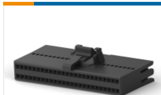
TE Part # 5-487937-0 050 HOUSING FFC 50CL DR LATCH