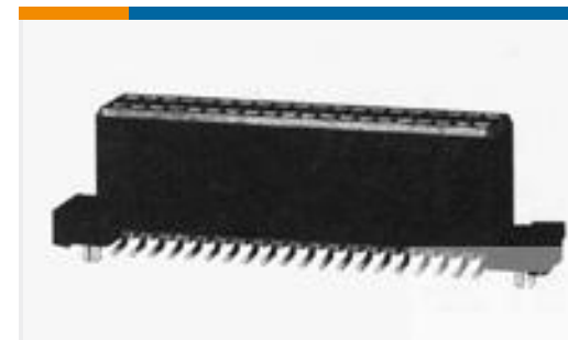
TE Part # 5-104550-6 50 SYS50 SURFMNT DRST RCPT SN