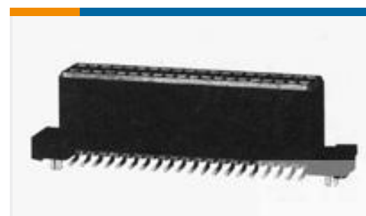
TE Part # 5-147378-5 50 SYS50 SMT RCP DR SHD SN