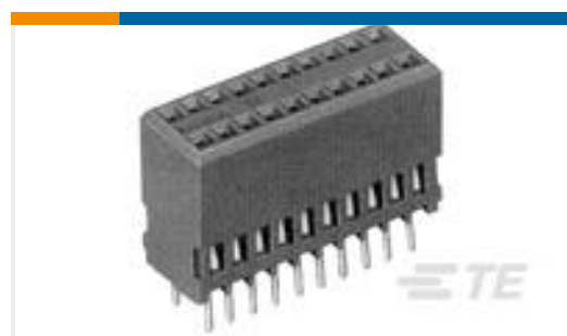
TE Part # 5-104744-7 50 SYS 50 RCPT ASSY DRST SN