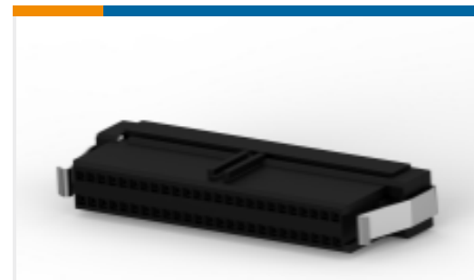
TE Part # 2-111196-1 50 RCPT SYSTEM 50, LEAD FREE