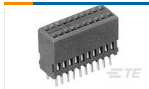
TE Part # 5-104078-5 50 SYSTEM 50 RCPT ASSY DRST SN